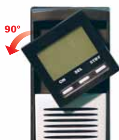
2. Rotate the mimic panel and insert it into position