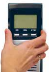
1. Remove the mimic panel